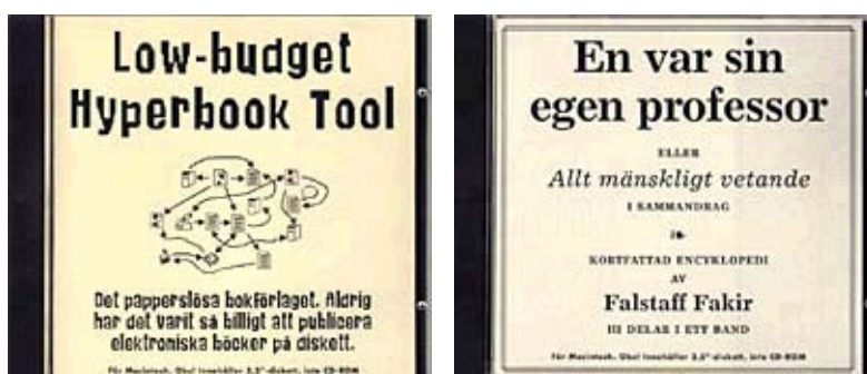
"Low-budget hyperbook tool" and the Swedish humor classic "Falstaff fakir", published in 1994. These were the first two titles of a planned series of small programs and e-books.

Working on the book during the spring and summer 1994 was a truly surreal experience, since I had an extremely tight schedule and was sup-