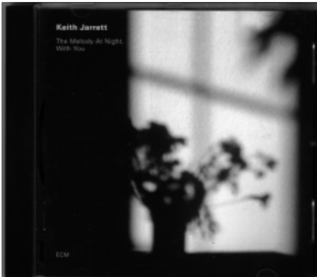
Keith Jarrett's "The Melody At Night With You", which was released in 1999.

As for many of us it took some time for Jarrett to get a diagnosis: "In the beginning, I just read and read, trying to figure out what the hell it could be", he says in the Los Angeles Times interview.